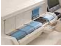
The VIDAS® system

The automated VIDAS® system (bioMérieux) using the Enzyme Linked Fluorescent Assay (ELFA) technique is suitable for routine, emergency, specific or complementary testing, notably in infectious diseases diagnostics.